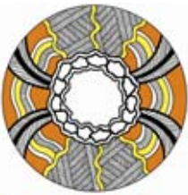
GUNDITJ MIRRORING Traditional Owners Aboriginal Corporation

GUNDITJ - EARTH MARA - PEOPLE MIRRORING - BELONGING