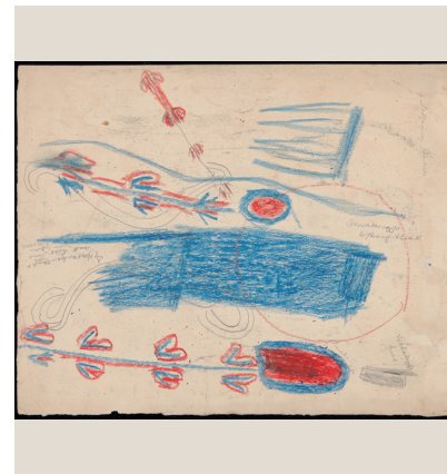
#30 Abe Jangala Mala (25 x 31 cm) (verso #31)