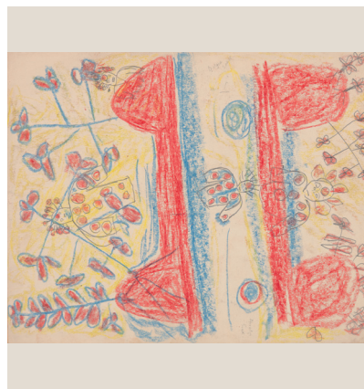
#29 Abe Jangala Jarnpa (25 x 31 cm)