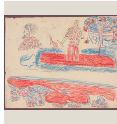
#27 Abe Jangala Jarnpa (25 x 31 cm)