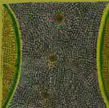
On the cover: Isaac Cherel, Billabong Country , 90x90cm acrylic on canvas. Copyright remains with the artist.

A defining characteristic of the Centre for Regional Development is its commitment to building regional development capacity through interaction, skills development and knowledge sharing between researchers, policy-makers and practitioners. Applied training programs and collaborative research projects with government and communities have boosted employment and prescient investment in rural, regional and remote Western Australia.