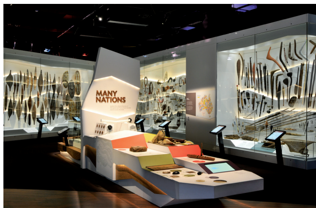
Above and right: the Bunjilaka Cultural Centre at the Melbourne Museum.