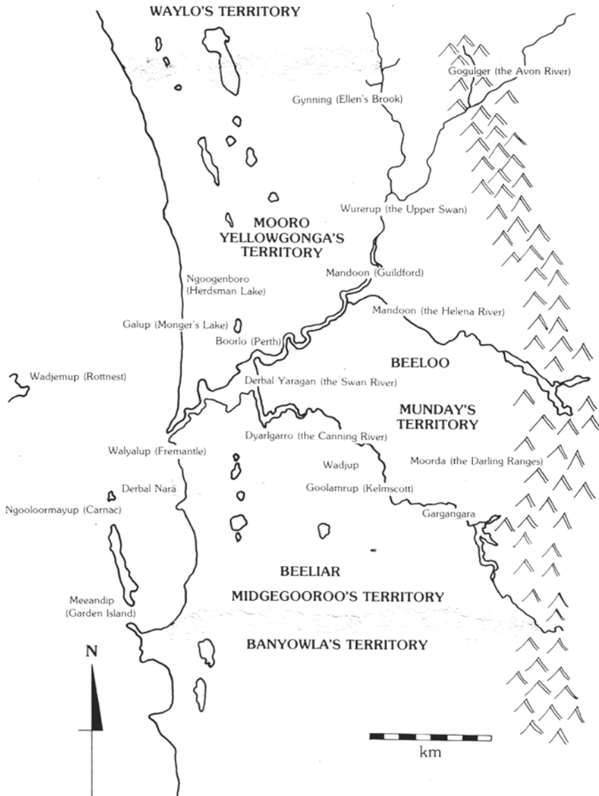
Figure 1: Place names and territories recorded by Robert Lyon in 1832 (Green 1979:174; map by Neville Green)

of Noongar within family groups, which he termed 'tribes'. In 1838 Stirling informed the Colonial Office that 'tribes' usually consisted of about 120 related persons ( Perth Gazette , 9 June 1838, p.91), almost double Armstrong's highest count; he may have been exaggerating the situation to gain support for a civilian militia.