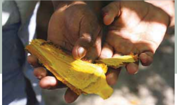
Yellow dye is extracted from the bark of the Morinda citrifolia to dye the fibre for string bags.