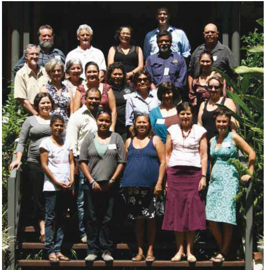
The Workshop on Indigenous Co-management and Biodiversity Protection.