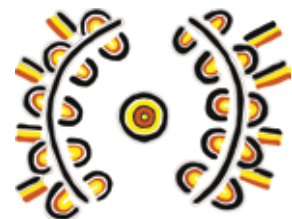
Central Land Council

Please send proposals in with the 'call for papers' application which can be found on the conference website: http://www.aiatsis.gov.au/ntru/ntc13.html