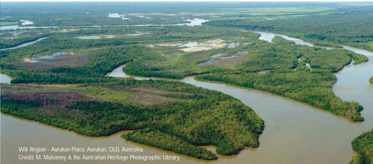
Wik Region - Aurukun Place, Aurukun, QLD, Australia.