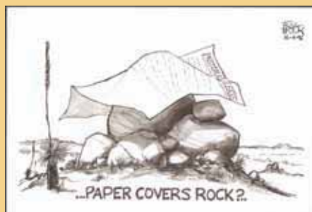
The 2012 Wik native title decision