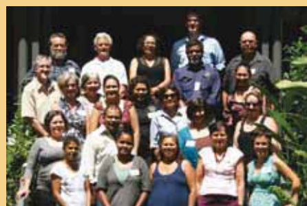
Joint management workshops