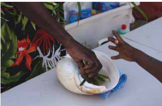
Lawyer cane/supplejack ( Flagellaria indica ) leaves in bailer shell have many customary medicinal uses.