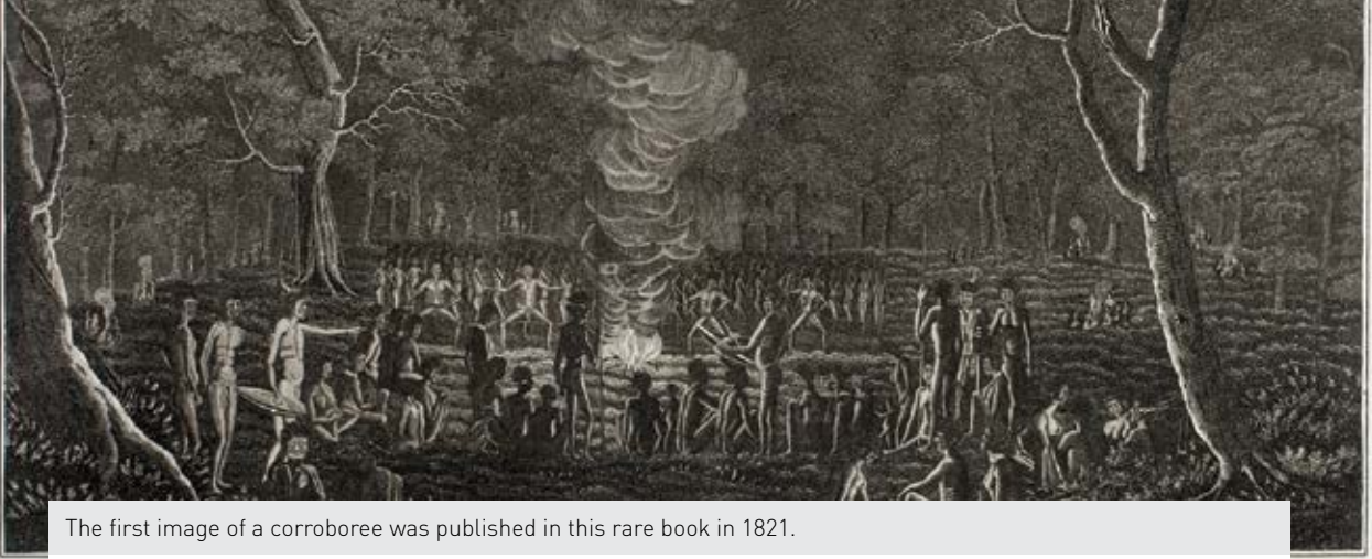
The first image of a corroboree was published in this rare book in 1821.