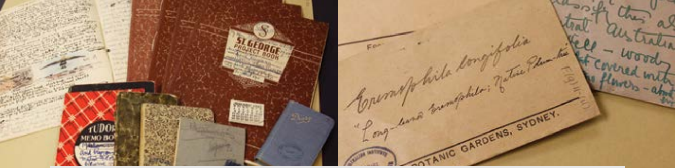
Left: A selection of the diaries and notebooks from the Olive Pink collection. Right: Botanic Gardens seed collection envelopes labelled in Olive Pink's handwriting.