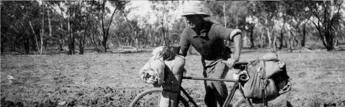
Top: Francis Birtles with his dog 'Dinkum' after a successful buffalo hunt, Northern Territory, c1924. Middle: Francis Birtles with a group of women and children, Central Australia, 1930s Bottom: Francis Birtles pushing his bicycle through rough terrain, North Australia, c1914.