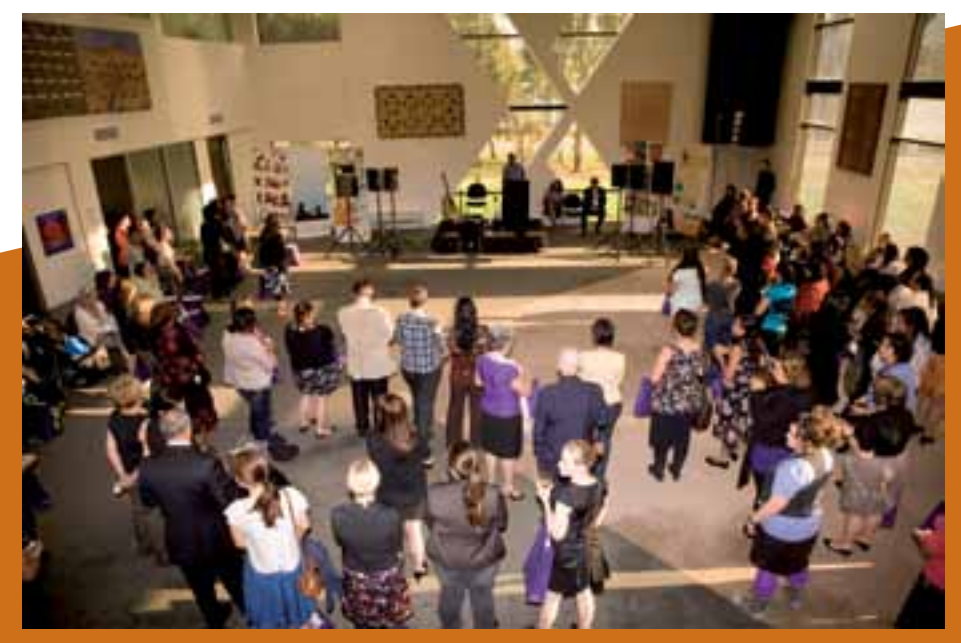
The contribution of AIATSIS female staff were recognised at a reception held at AIATSIS to celebrate International Women's Day.