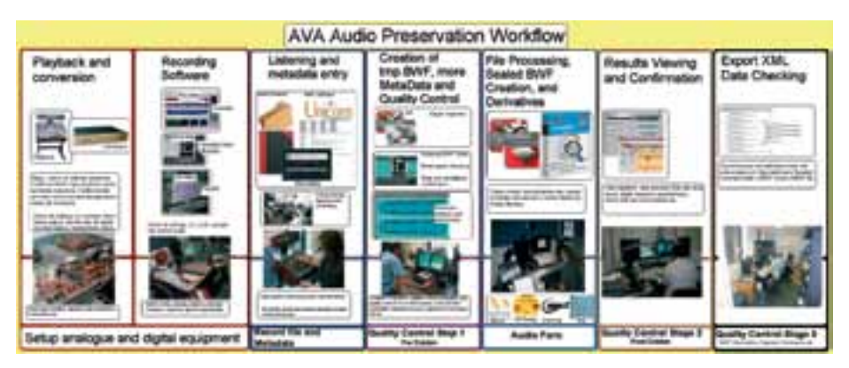
Figure 7: Audio preservation workflow