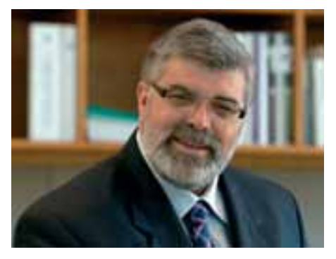
Senator Kim Carr, Minister for Innovation, Industry, Science and Research

The Hon. Kim Carr Minister Department of Innovation, Industry, Science and Research Parliament House Canberra ACT 2600