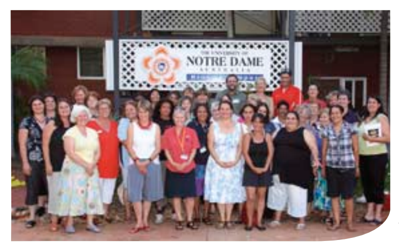
Participants in the annual ATSILIRN conference, held in Broome in April

In April 2009, the Aboriginal and Torres Strait Islander Library and Information Research