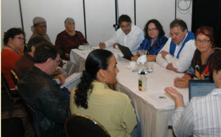
AIATSIS at the WHO International Symposium on the Social Determinants of Indigenous Health in Adelaide, April 2007.