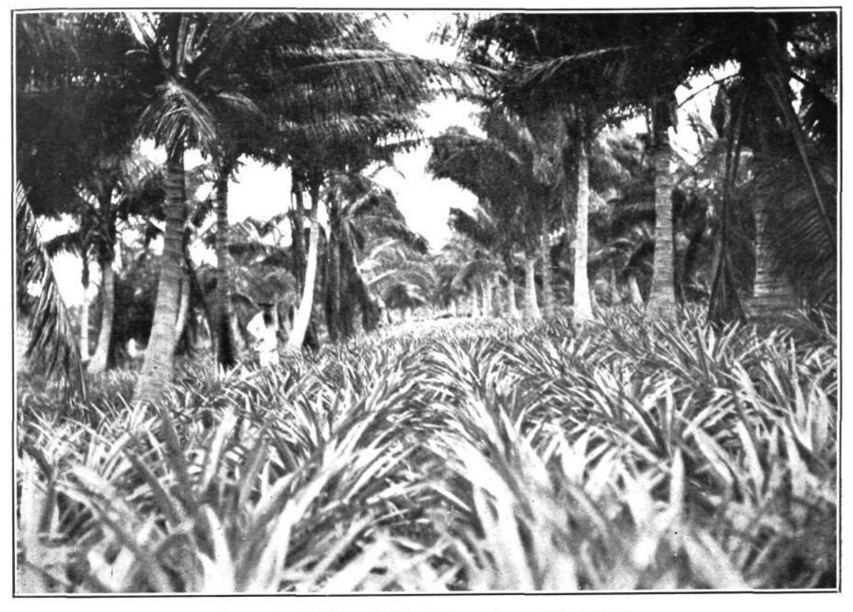
Cocoanut and Pineapple Plantation—Cape Bedford Mission.