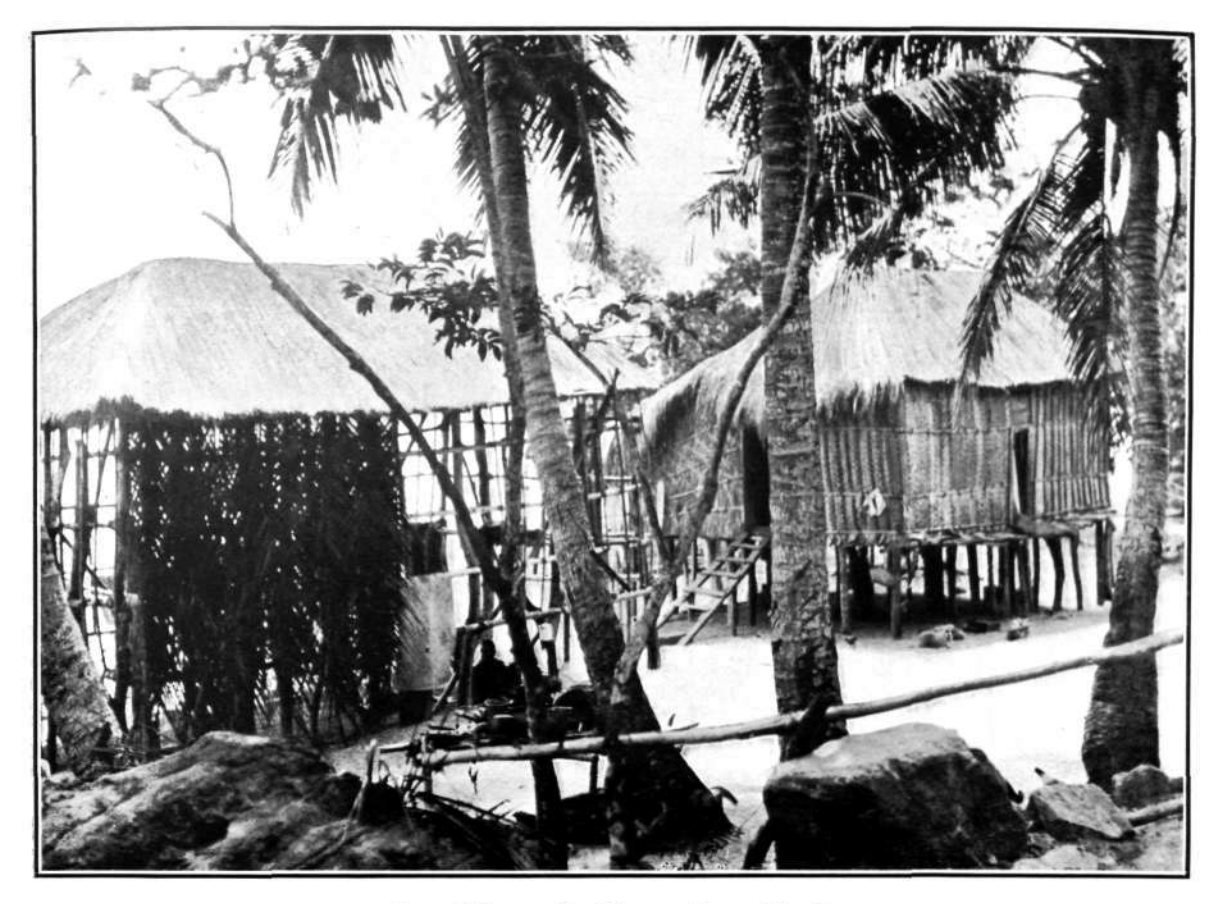
Type of Cocoanut-leaf House-Murray Island.