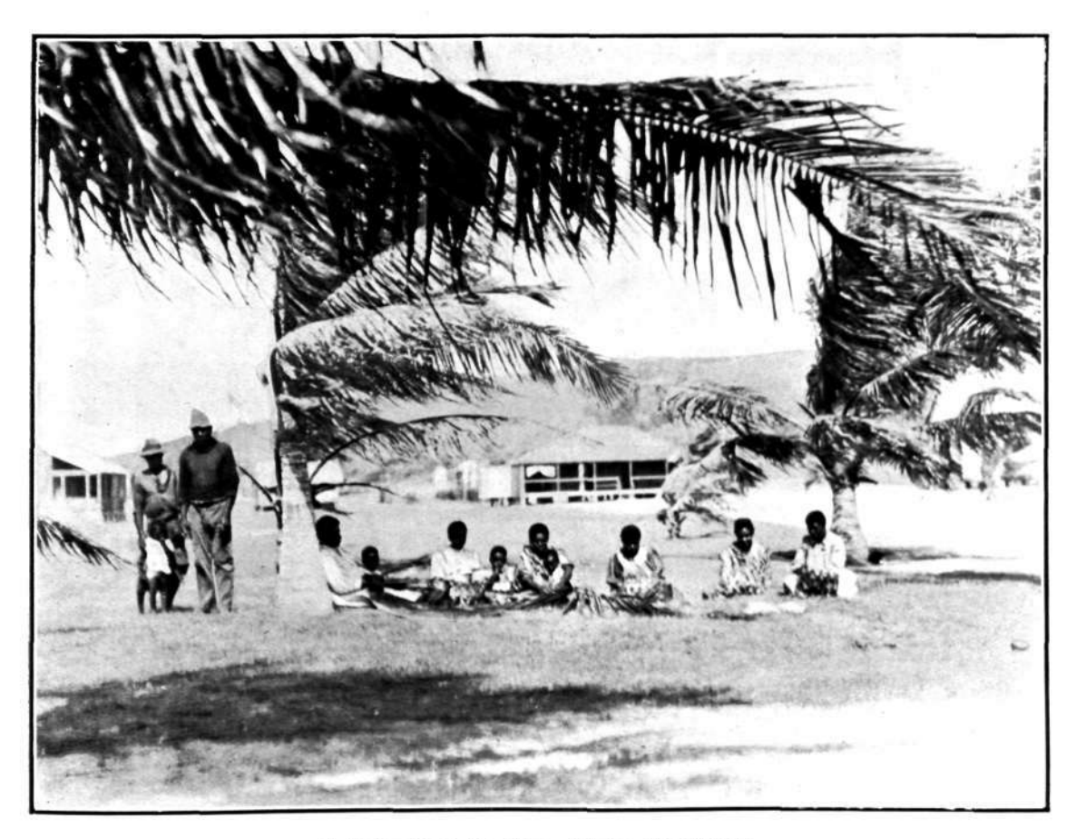
Basket-making-St. Paul's Mission, Moa Island.