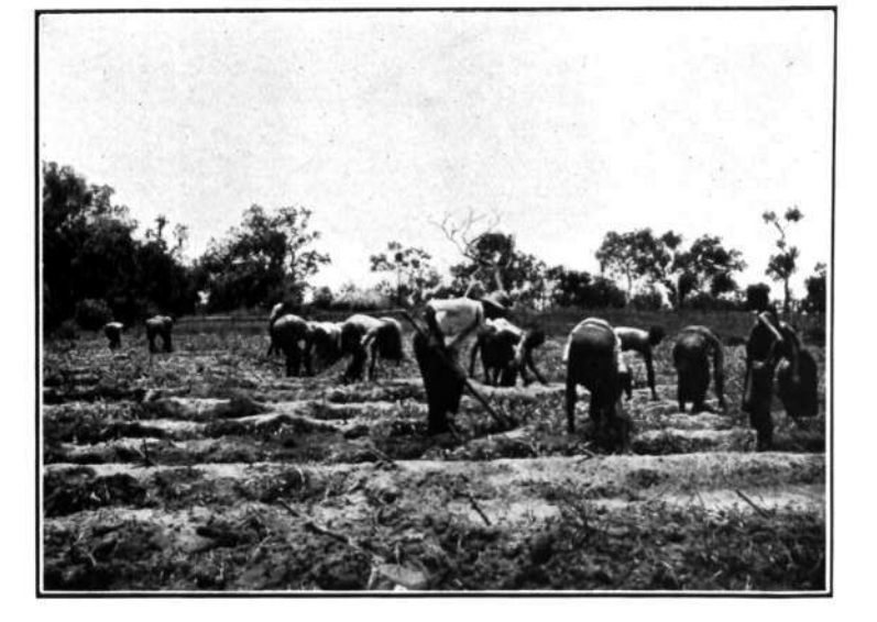
Working on Cultivation-Trubanaman.