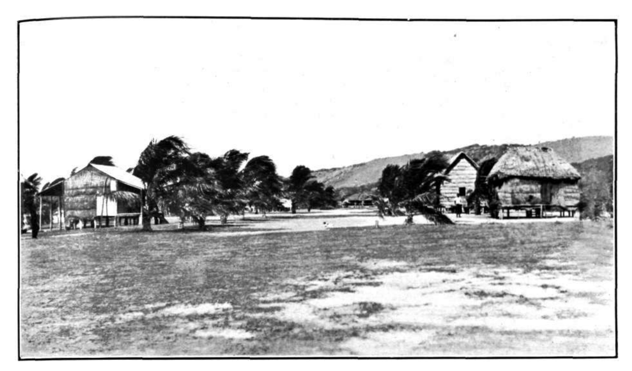
Village-St. Paul's Mission, Moa Island.