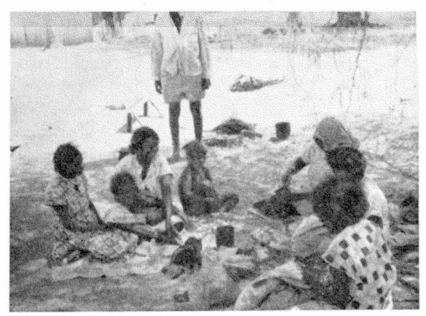
Tea-time on the C.S.I.R.O. farm at Katherine in the Northern Territory-a very important time for all