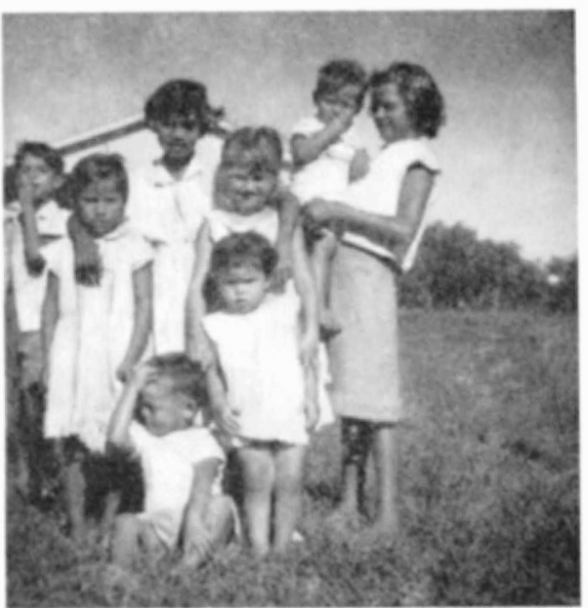
A happy group of Cabbage Tree Island youngsters