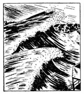
Sixty feet is usually cited by experts as the greatest possible height a wave at sea can attain. However, in the Pacific Ocean, on February 7, 1933, during a 68-keot gale, the U.S.S. Remapo recorded a wave 112 feet from trough to crest,