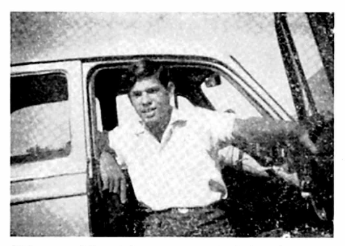
This young fellow (whose name we don't know) appears all set for a long drive.