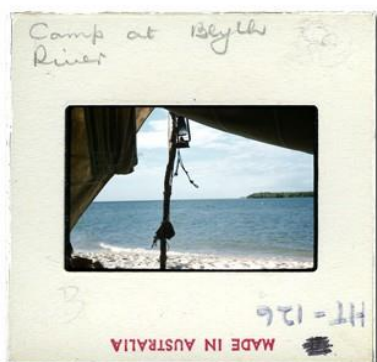
Camp at Blyth River, Maningrida, NT, 1958

The series also included a 'Filco Mark 450' wooden slide box containing Hiatt's colour transparencies taken during his field trips to Maningrida (1958, 1960), Kopanga (1960), East Arnhem Land (1963), Maningrida (1967), and Maningrida and Kopanga (1975); photographic negatives taken in Ceylon [Sri Lanka] (1970) and genealogical cards compiled in Kopanga (1975). These were transferred to the Pictorial Collection in September 2006.