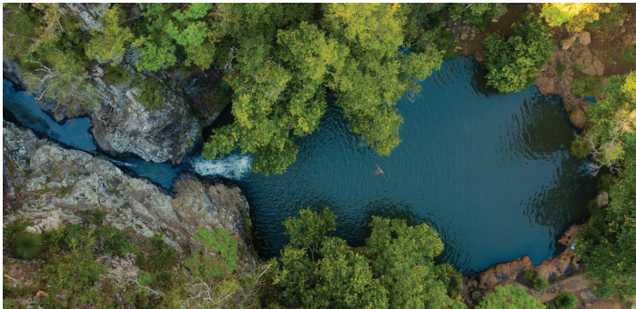
Kondalilla Falls in the Kondalilla National Park, Montville.