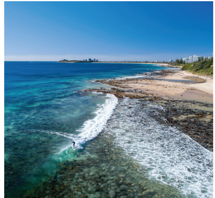
Alexandra Headland.