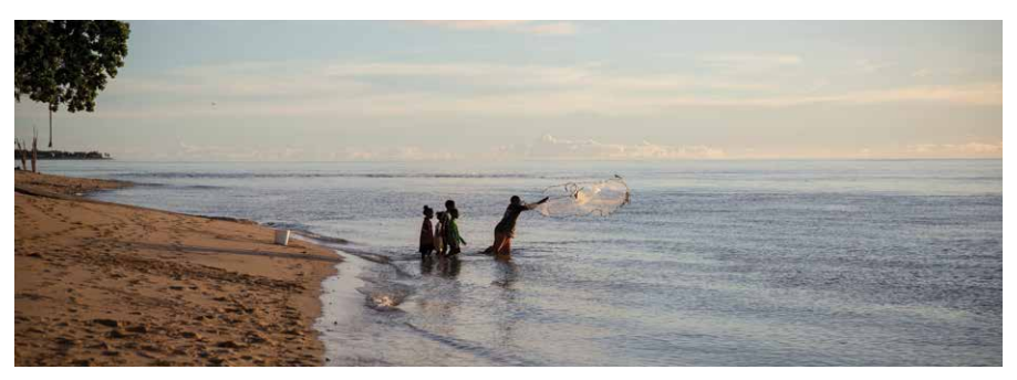
Family fishing using a cast net on Mer (Murray Island) in the Torres Strait.

As part of Australia's education community and through our education strategy, AIATSIS will promote educational excellence and equity by providing culturally responsive professional learning, and generating authoritative curriculum resources to teach about local, regional and national Aboriginal and Torres Strait Islander histories and cultures.