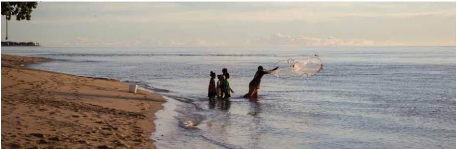
Family fishing using a cast net on Mer (Murray Island) in the Torres Strait.

Programs will focus attention on collections transformation initiatives, AIATSIS online initiatives and ICT capability improvement activities.