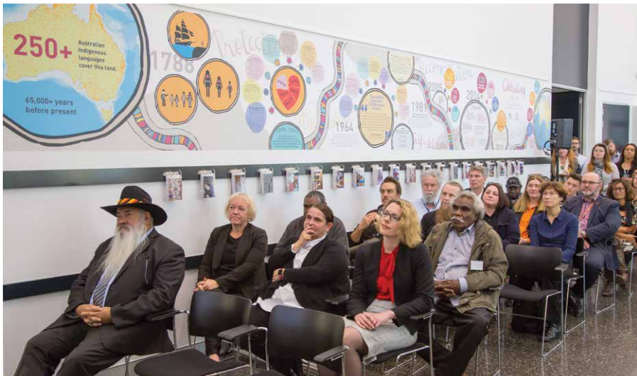
Guests at the opening of AIATSIS International Year of Indigenous Languages exhibition Our Language: Keeping Us Strong.