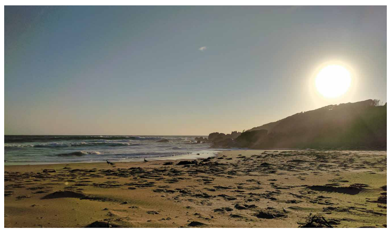
Bingi Beach, NSW, Yuin country.