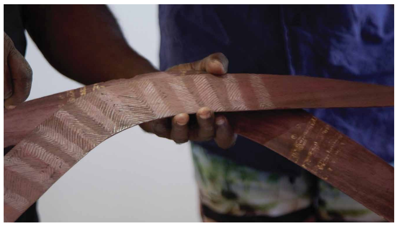
Boomerangs repatriated to the Bardi Jawi from the Illinois State Museum, October 2019.

The ISM recognises the significance of returning cultural heritage objects to their Traditional Custodians, in this case the Aranda and Bardi Jawi. More than returning items, it is a return of authority over cultural knowledge to these communities. One aspect of the ISM's mission is "to promote stewardship of cultural and natural resources for the future." The transfer of objects into the care of the Aranda and Bardi Jawi fulfils this mission, as Lawmen in each community will use the items in ceremony and to teach young men about their history. The ISM is honored to have cared for the objects for over seven decades and to be among the first to work with AIATSIS to return them home.