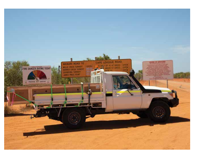
Left: Bardi Jawi Rangers privately loading their material onto the ute at the KLC. Right: Christopher and lain's ute loaded with the spear box on the Cape Leveque road.