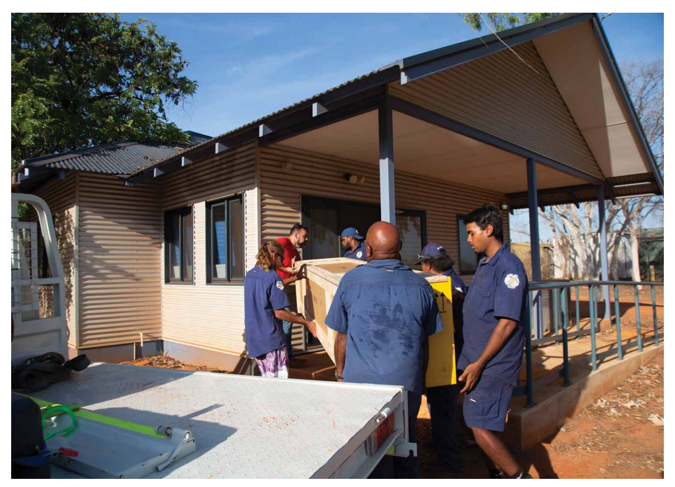
AIATSIS and Bardi Jawi Rangers carrying the material into the PBC office.