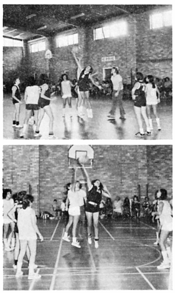
NEW DAWN. June. 1974

The national team will tour overseas later in the year.