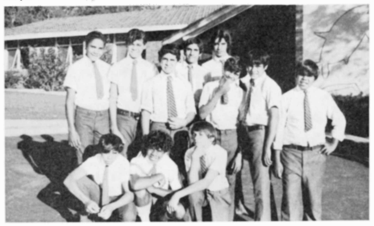
Some of the students at Kirinari, Sylvania

year Kirinari has twenty-five students attending two local schools and eight boys who are holding down full-time jobs. One student is sitting for the Higher School Certificate and two are in 5th form. Of the nine boys sitting for the School Certificate this year, eight will be taking full-time employment next year. Kirinari's ex-students include apprentices in many fields, a fully trained PMG