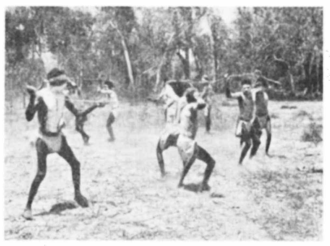
In song and dance, tribal aborigines acted out their myths and legends

Despite their primitive material culture, the aborigines built up highly complex rules to regulate their lives, a profound spiritual culture, and distinctive art forms. They were simple people, shy rather than aggressive,