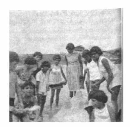
Three snaps of happy Cootamundra girls on the beach at Kiama