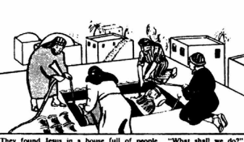
They found Jesus in a house full of people. "What shall we do?" they asked one another hopelessly "If we take him back home, he will die!" One suggested, "I know what we will do. Let us break the roof of the house and let him down." They began to do this.