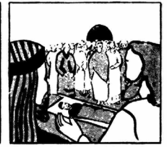
The amazed crowd watched the men lower their friend through the broken roof to Jesus. He saw their great faith and said to the man, "Son, thy sins be forgiven thee!"