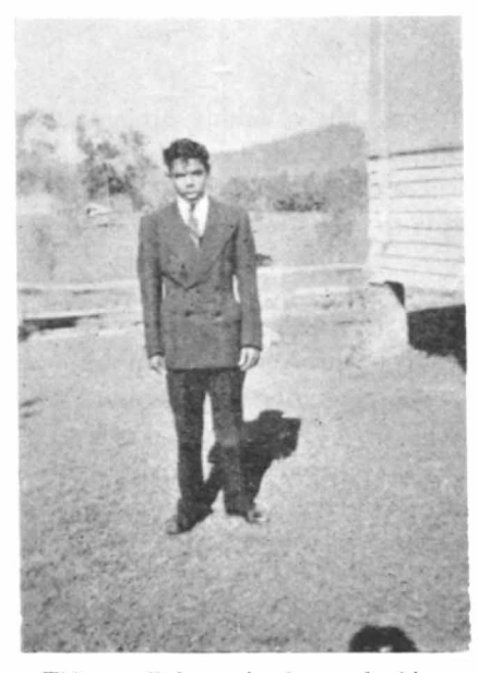
This well-dressed dapper-looking young fellow comes from Tabulam, but we don't know his name. Do you ?