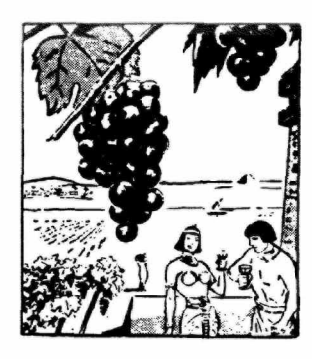
Grapes have been cultivated so long that their place of origin cannot be determined. Egyptians evidently grew grapes and made wine 6,000 years