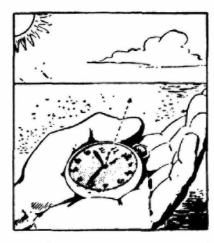
A clock is a compass. Hold clock (or watch) face up and point the hour hand toward the sun. Halfway between the hour hand and 12 is due south