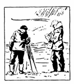
By studying the folds and hummocks of Antarctic ice, scientists hope to gain clues to the ways the Alps, Himalayas, and other mountains were formed