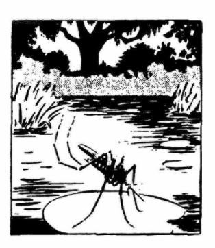
Mosquitoes plague man from the Tropics to the Arctic Circle. Only the female mosquito bites, and her principal food is not human blood, but plant nector.