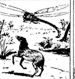
There was a time in the world's his-tory when horses were no larger than ordinary cats and dragonflies were sometimes more than two feet long