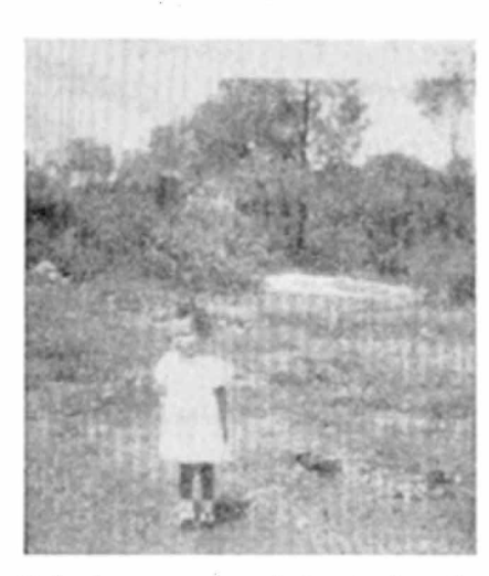
This demure young lady was too shy to even give her name.