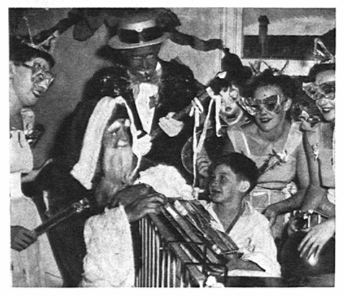
Even the youngsters in hospital had a visit from Santa Claus and his Merry band last month.

This summer you'll have no trouble with recurring fly dirt on your mirrors if you rub them down every few weeks with a cloth dipped lightly in methylated spirits.