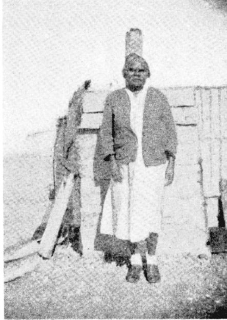
This old aboriginal woman lives far out on the lonely Birdsville track.