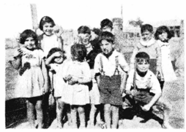
First of all a group of happy healthy school children, at Marree.

As the Cameraman made his way inland these are some of the people he met.