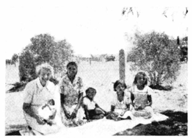
An Aboriginal family at Marree.