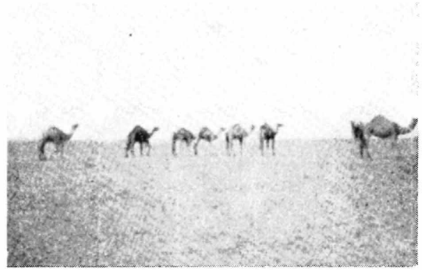
One of the many teams of camels one sees about Marree.