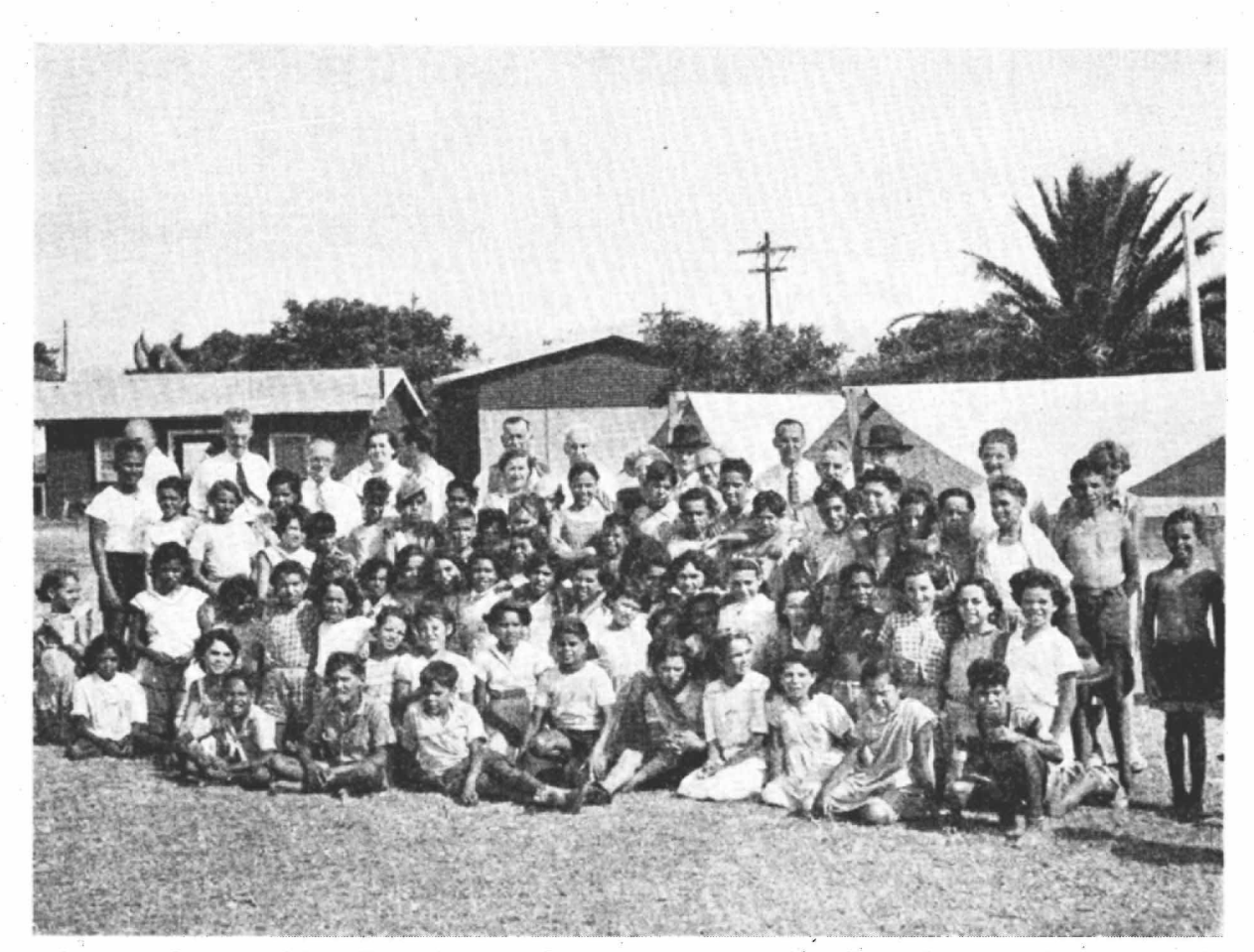
A group picture showing all the Summer Camp youngsters, the members of the Board and the staff (in the background). These children who come to Sydney once a year and are entertained have the opportunity of learning all manner of things and invariably they return to their country homes much wiser.