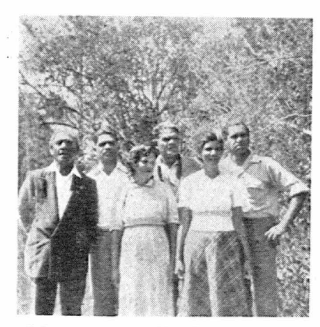
A happy group of Purfleet residents pose for the cameraman.