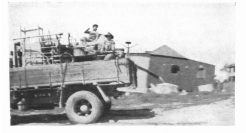
When "Moving Day" came round to Yass recently, everything was piled on the old lorry for transport to a new home.

If you have photos at home, similar to those you see published in Dawn , send them along and thus add to, and maintain, the interest in your fellow men and women.