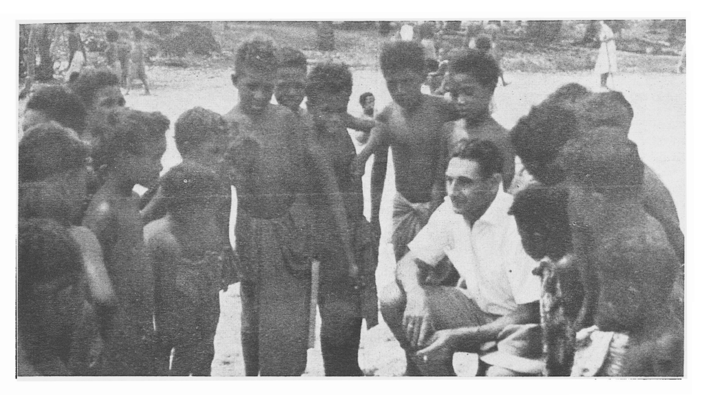
The cameraman had to go a long way to get this photo, thousands of miles away to New Guinea, as a matter of fact. And as you see, he found the Editor of Dawn surrounded by a group of young Papuan friends