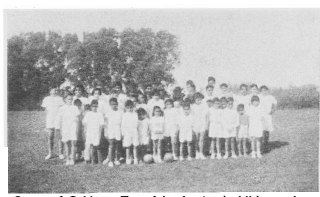
Some of Cabbage Tree Island school children who participated in the recent inter-school sports