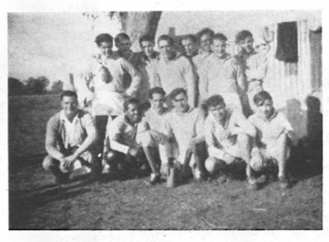
Popularly known as the "Rats", the Caroona B team has played excellent allround football this season