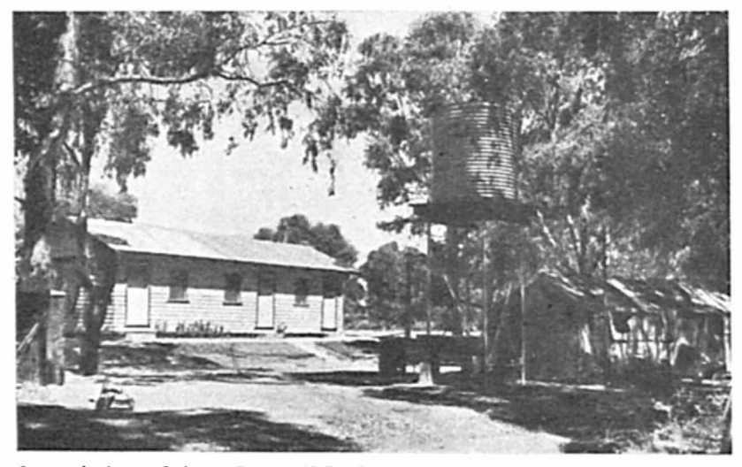
A good view of the "Centre" Project showing main building, bathroom (at left), water tower, tank, copper, wash troughs, all put in by the "Centre" committee. Note the contrast of old and new, and the electric light on building.