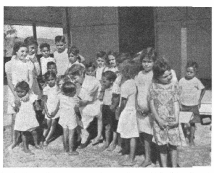
A "new" boy meets the teacher on his first day at Tabulam school.

Neat white fences and well-kept lawns make the administrative block at Tabulam particularly attractive.