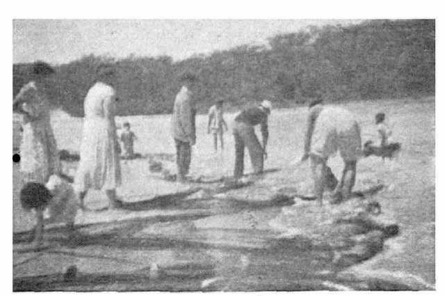
Everyone, even the dog, lends a hand (or a paw) when the haul is made.