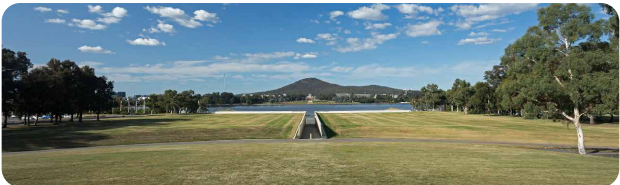
The Ngurra site looking towards Mount Ainslie.

Ngurra appears in many different Aboriginal languages around Australia and is a word for 'home', 'camp', 'a place of belonging', 'a place of inclusion'.