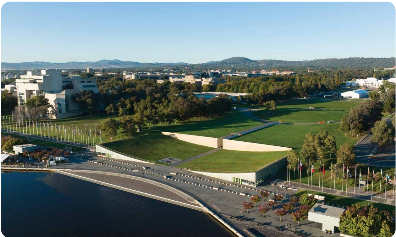
The Ngurra site.

*Forecasted project schedule – subject to change.