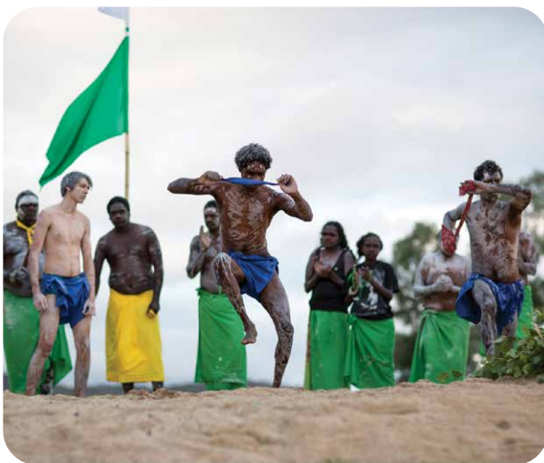
Yolngu and Binninj Elders and dancers from Arnhem Land perform a Lorrkkon ceremony at Reconciliation Place to celebrate the 50th anniversary of AIATSIS in 2014.

The new home for AIATSIS will be an internationally recognised institution promoting deeper engagement with Aboriginal and Torres Strait Islander cultures, traditions, languages and stories, past and present. It will be a place of celebration, storytelling, teaching, learning, reflection and healing, research and scholarship into Aboriginal and Torres Strait Islander culture, history and heritage.