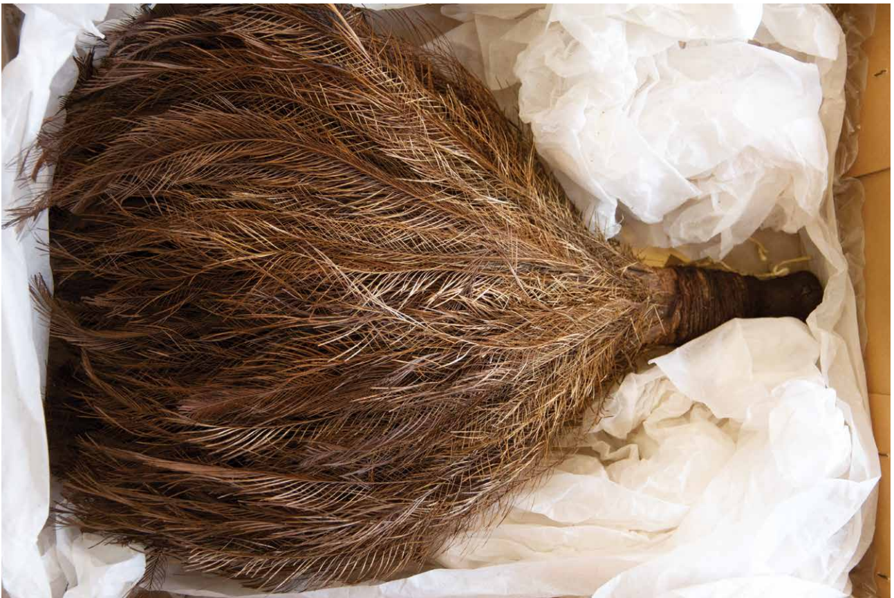
Nyamal feather body ornament repatriated from Manchester Museum.

A ramification of the COVID-19 global pandemic on the RoCH project was the cancellation of the final 'follow up' research phase with each community partner. In this phase, AIATSIS intended to meet with key individuals involved in the repatriation, particularly Elders and other knowledge holders, to discuss the material and the impact of its return for their community. This research phase was intended to inform the next section of this report and provide an opportunity to document and record each community's perspective on the significance of repatriating cultural heritage material to First Nations people for the purposes of cultural revitalisation and maintenance.