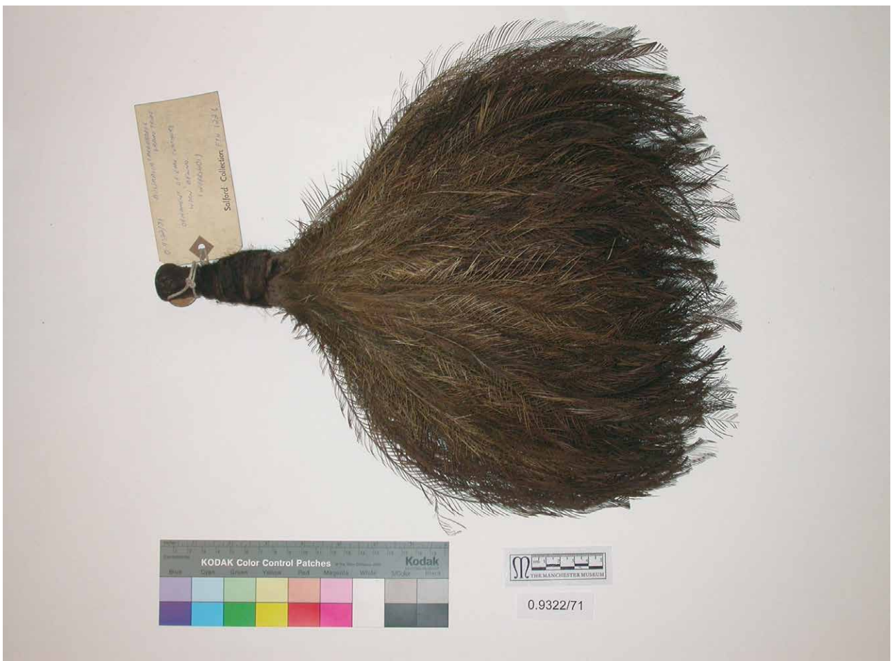
Nyamal body ornament: arm band made of emu feathers worn during lore ceremonies and corroborees.