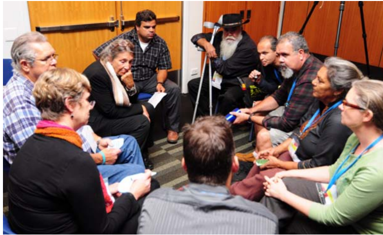
Workshop panellists, specialist participants and attendees in small group discussions at the 2011 Native Title Conference.