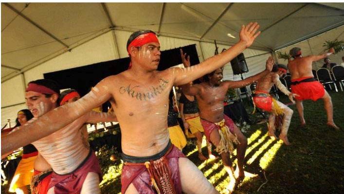
Nunukal Aboriginal Dancers perform at the celebrations.