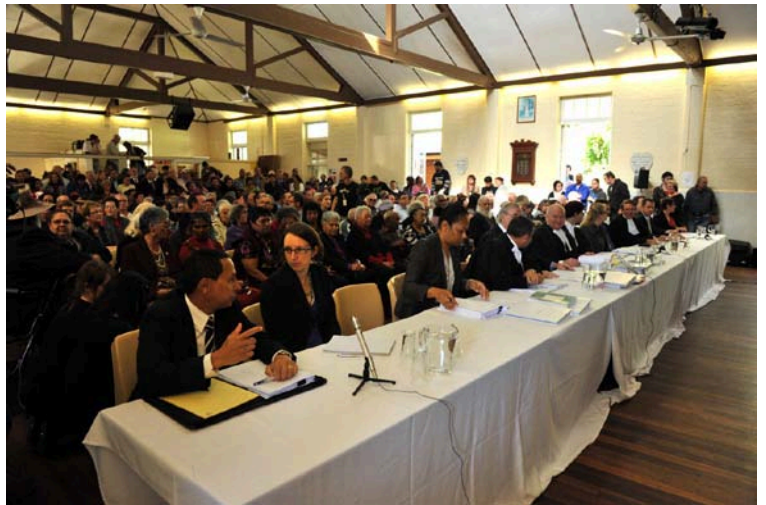
Standing room only at Dunwich Hall.

The determinations recognise exclusive native title rights over 2,264ha of land; non-exclusive native title rights and interests over approximately 22,639ha of land including the majority of North Stradbroke Island, Peel Island, Goat Island, Bird