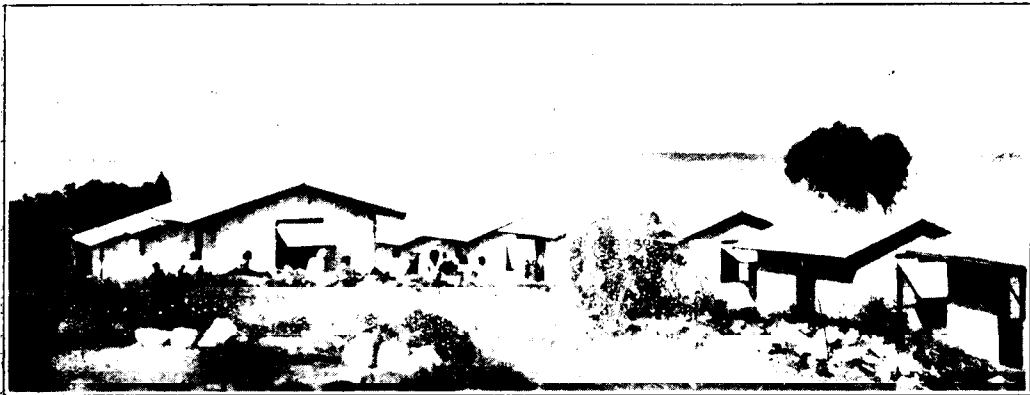
Photograph "B"—Darwin Leprosarium.