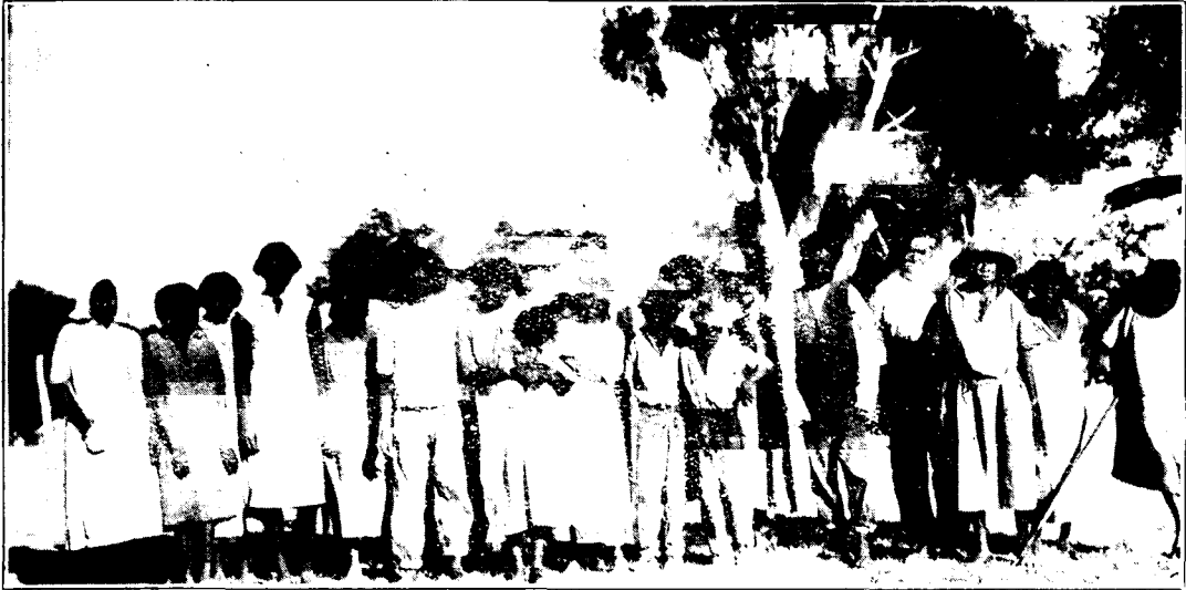
Photograph "D"—Natives at Violet Valley Station.