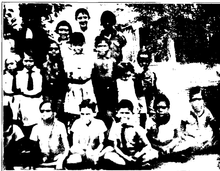
Photograph "I"—Teacher and Children at Kunmunya Mission School.