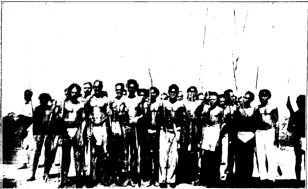
Photograph "F"—Drysdale River Mission Natives.