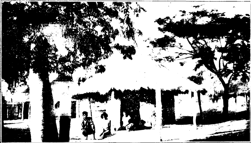
Photograph "E"—Forrest River Mission.