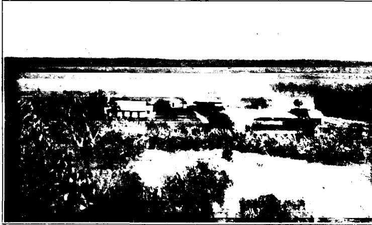
Photograph "G"—Kunmunya Mission, Port George IV.