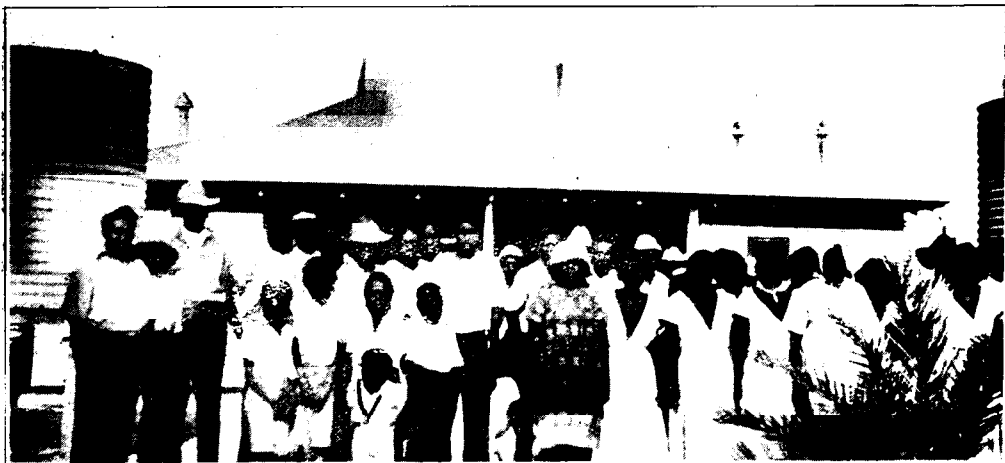
Photograph "C"—West Australian Patients at Darwin Leprosarium.