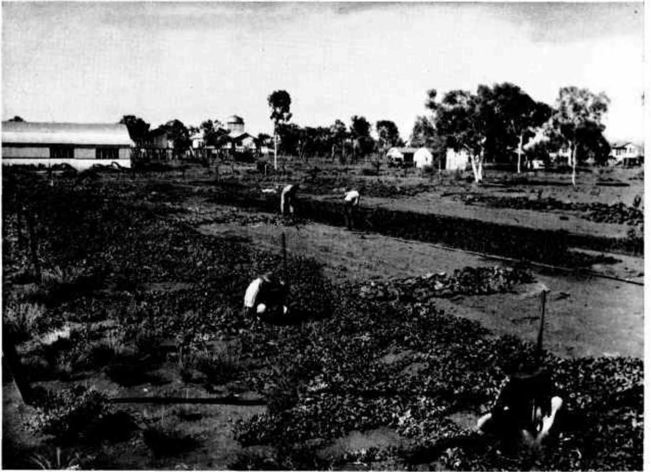
Part of the farm at Warrabri Government Settlement.