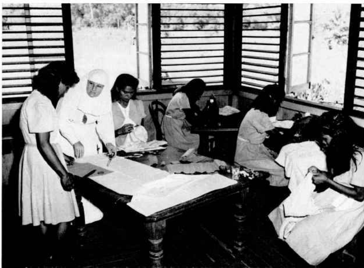
Dressmaking class at the Garden Point Mission.