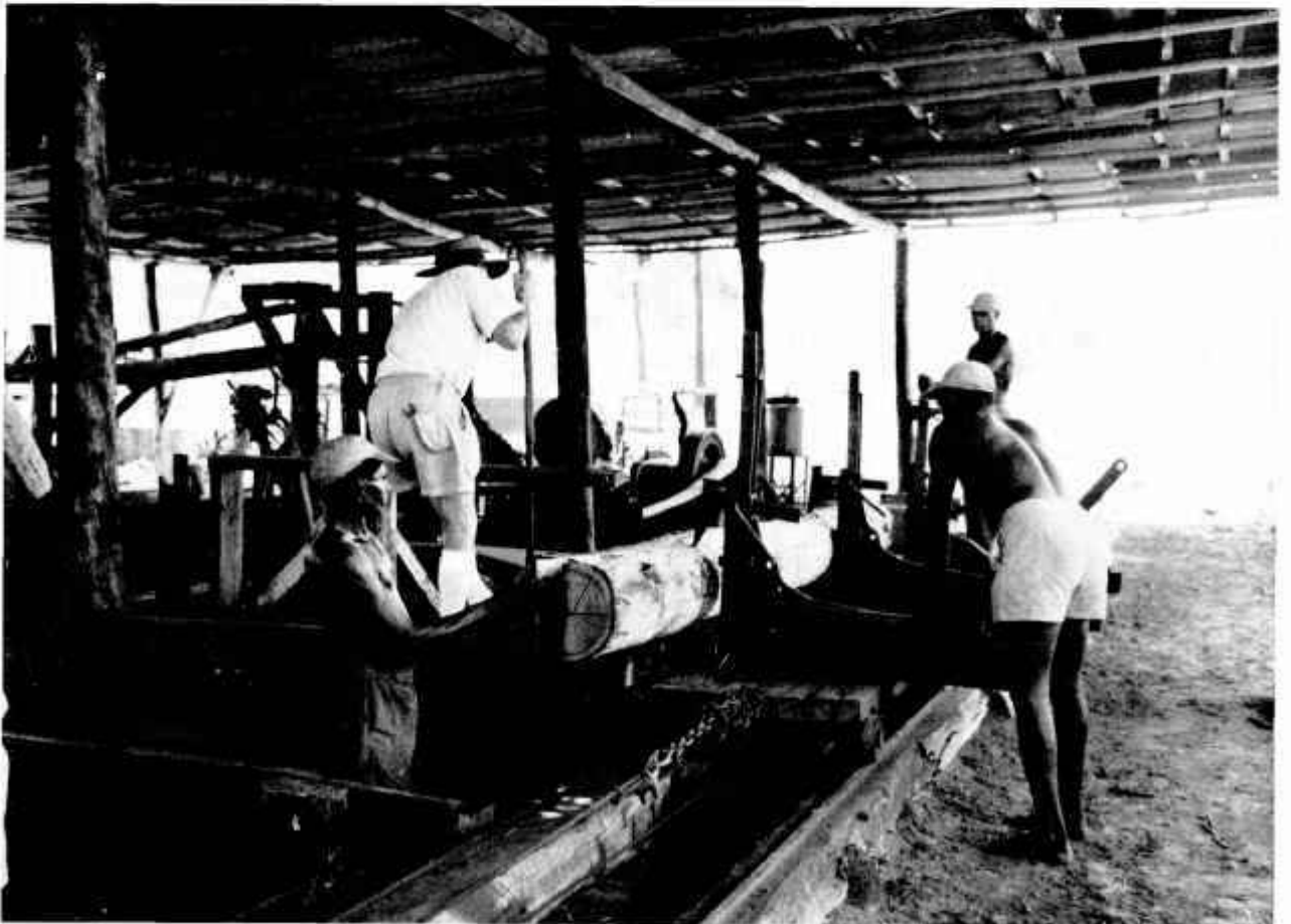
Sawmill at Snake Bay Government Settlement, Melville Island.