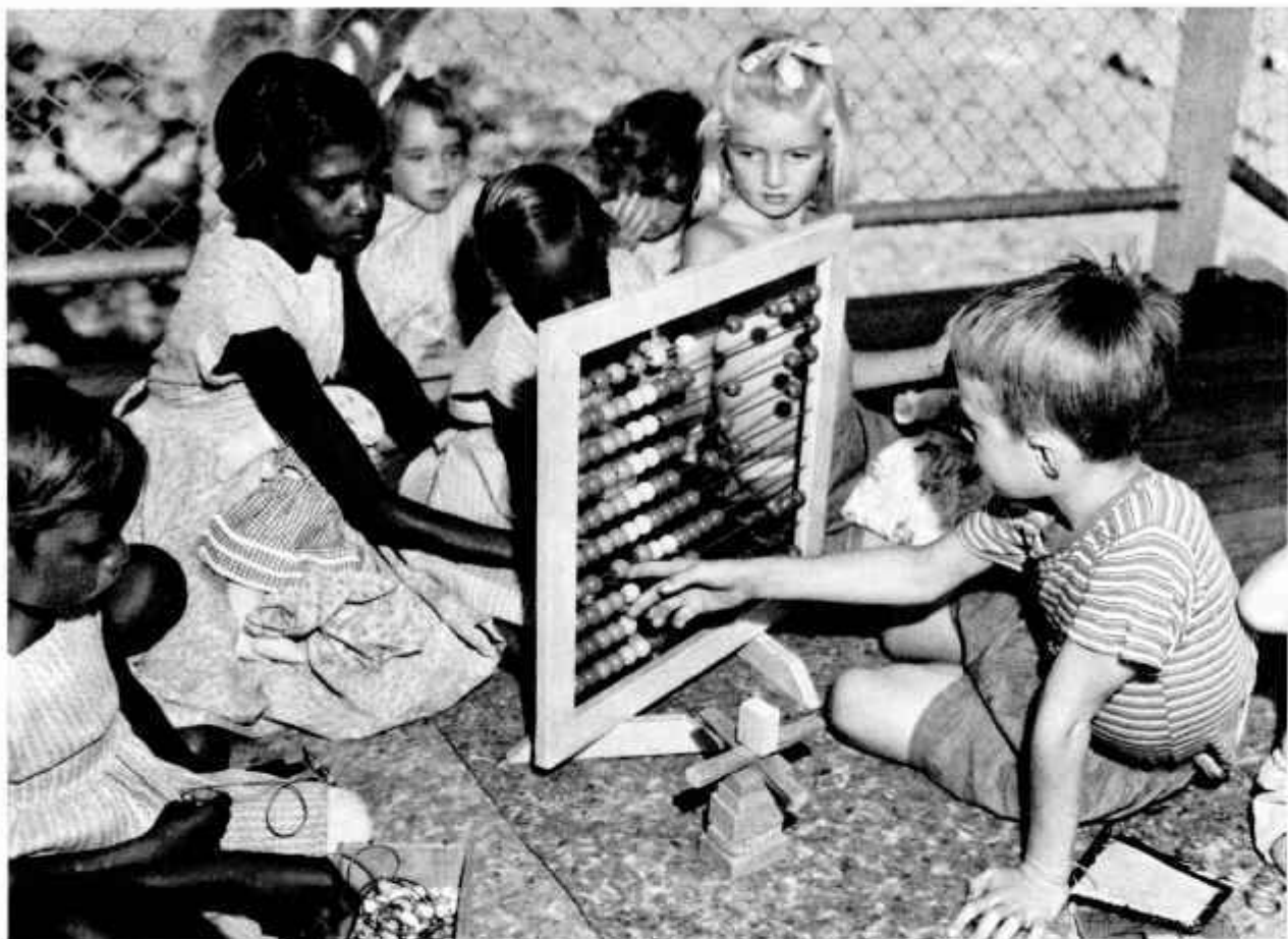
School children at Warrabri Government Settlement.